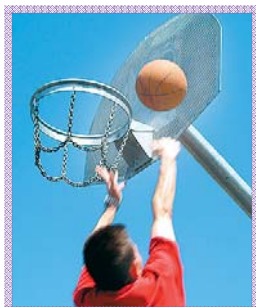
3 play basketball