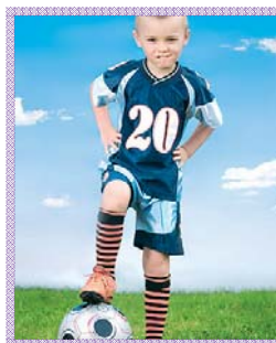
2 play football