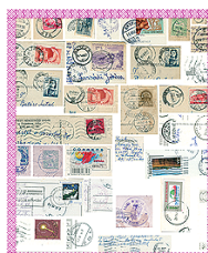
6 ..... stamps