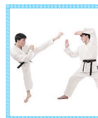
4 ..... karate