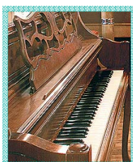
5 ..... the piano