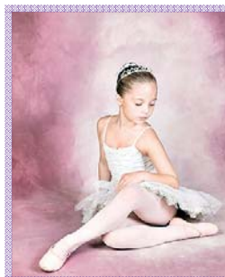
4 do ballet