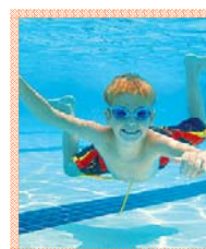
7 ..... swimming