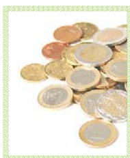
2 ..... coins