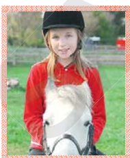
1 ..... horse riding