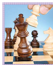
3 ..... chess